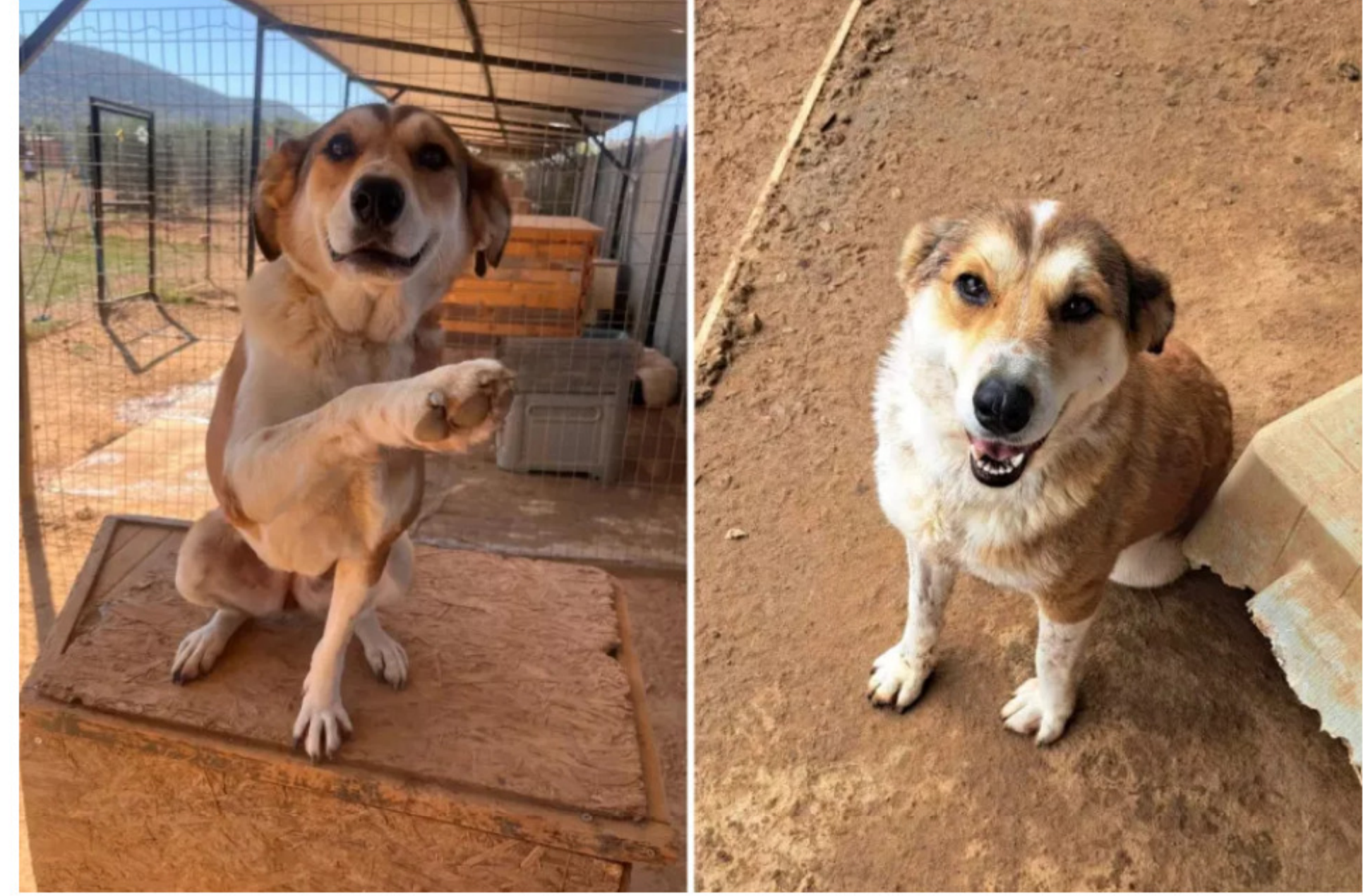
Pictures of Nelly, who wants lots of attention from humans who come by the shelter. Affectionately dubbed "Crazy Nelly," she has a habit of "screaming" every time she sees a human.

Despite being sweet and affectionate with people, Nelly hasn't found a home after half a decade in the shelter. She came into the care of the foundation after a difficult start to life.